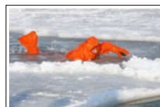
Prince Harry joins Arctic trek