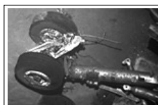
Air France plane wreckage parts found