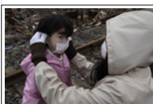
Millions without food, water, power in Japan